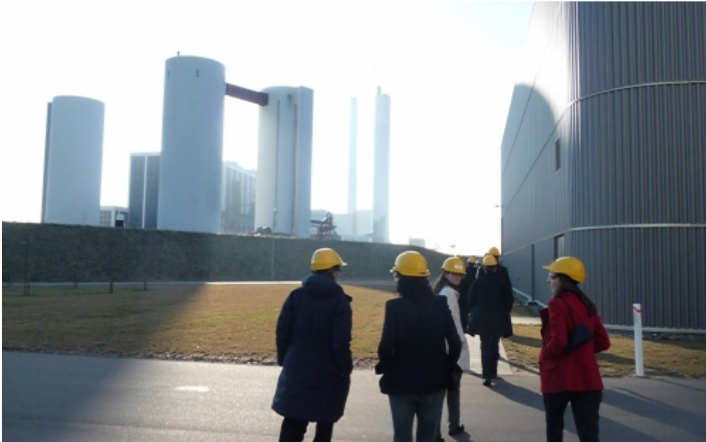
Visitor programme: I-CITE Study Tour