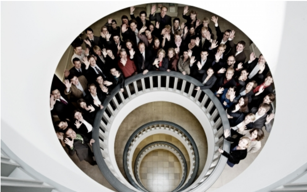
Ecologic Institute' staff