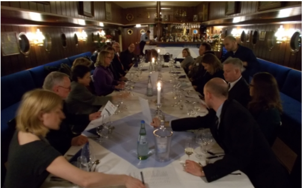
Riverside Chat on 24 March 2015