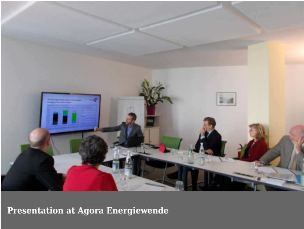
Presentation at Agora Energiewende