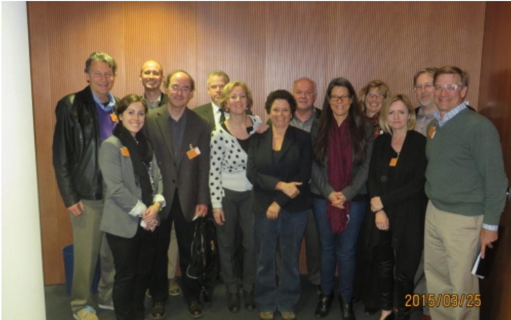
View the full image [14]