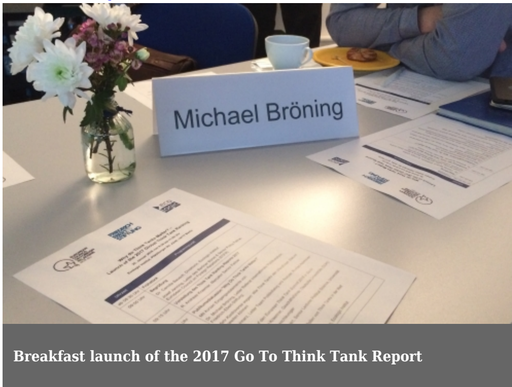
Breakfast launch of the 2017 Go To Think Tank Report