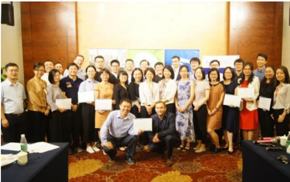
Closing ceremony of the Haikou Advanced ETS Training