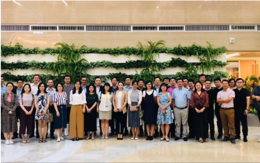
Site visit to Hainan Airlines