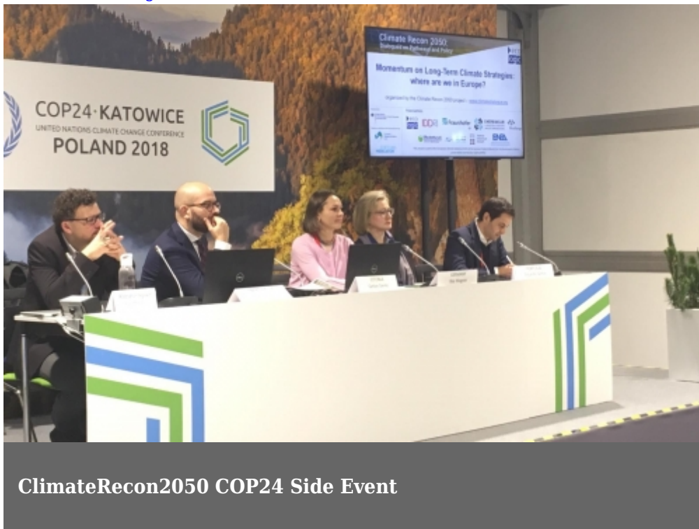
ClimateRecon2050 COP24 Side Event