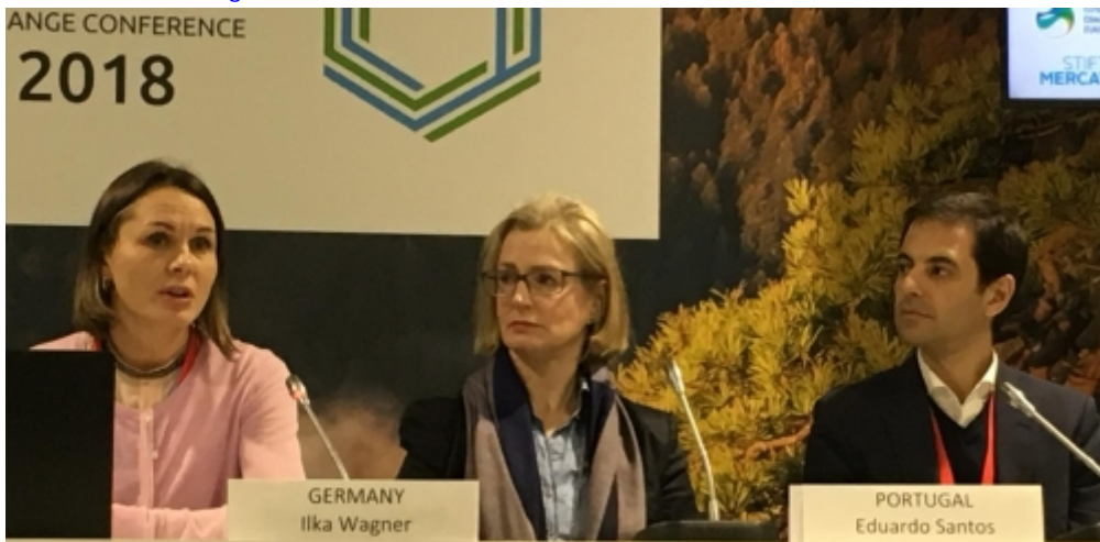
ClimateRecon2050 COP24 Side Event