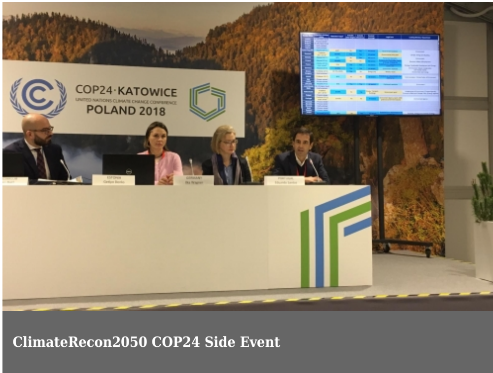
ClimateRecon2050 COP24 Side Event