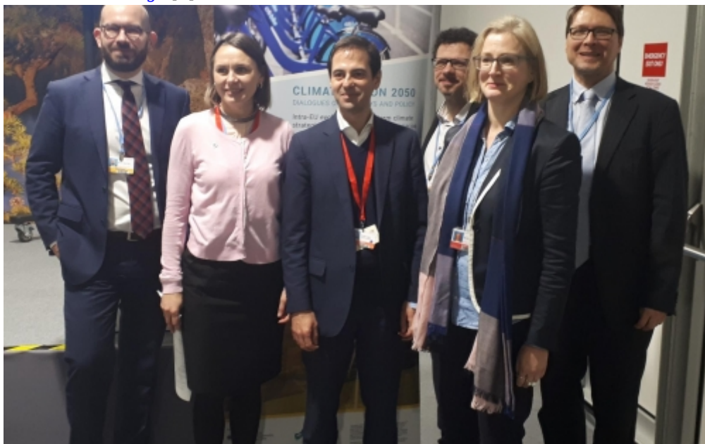
ClimateRecon2050 COP24 Side Event