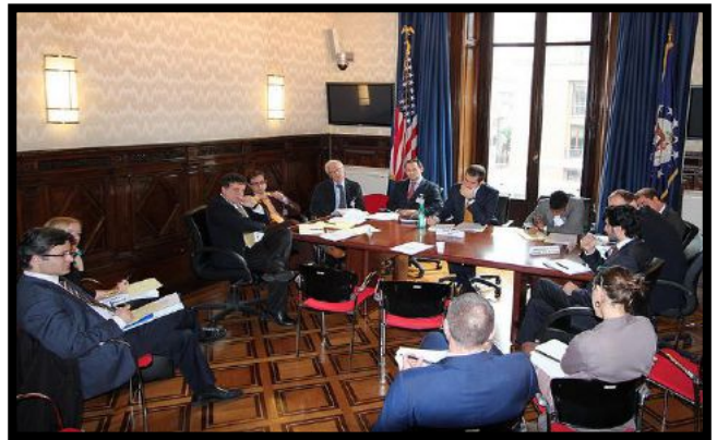
Participants discuss think tank solutions during a break-out session.