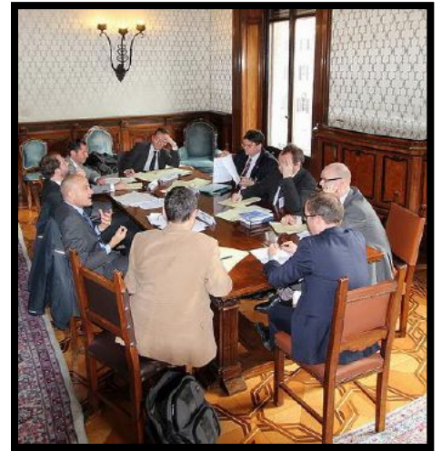
Participants share ideas in a breakout session.