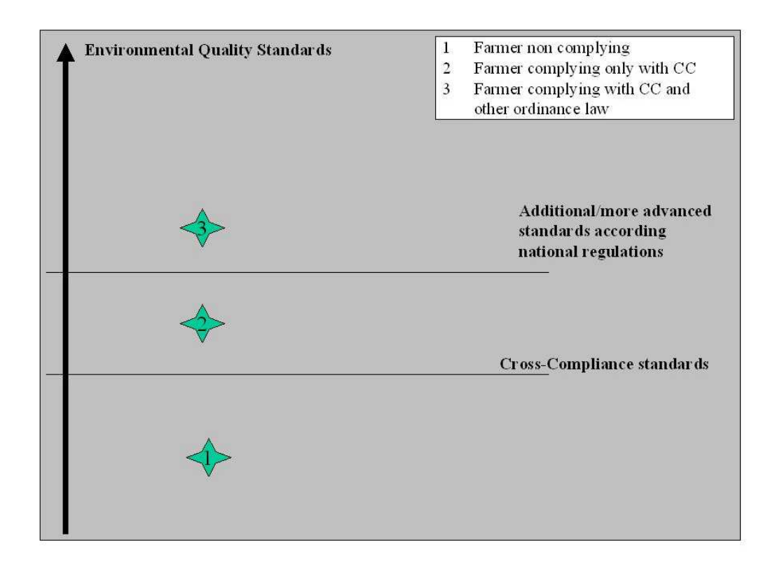
Figure 1: Cross-compliance in context of environmental quality standards

as only 1% are likely to be inspected in any one year. Concerning the compliance with CC and with the underlying standards 3 situations are possible (see Figure 1).