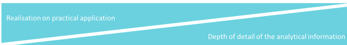
Figure 2: Identification of examination objective and result