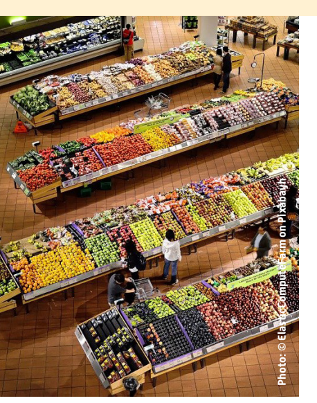
The amount of plastic packaging used for food and cosmetic products has been steadily increasing over the years.

Consumers in Germany attach great importance to reducing packaging when shopping. However, only few take advantage of unpackaged food options. There is also a lack of transparency regarding packaging produced prior to sale. In order to avoid or reduce packaging in supermarkets, active commitment on the part of retailers and transparent guidance from policymakers are necessary.