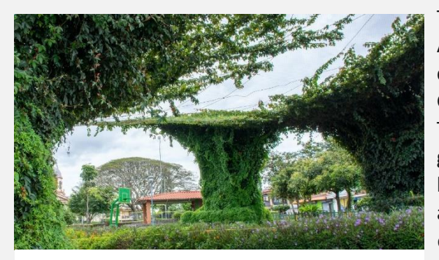
Figure 1: Corredor Biológico Interurbano María Aguilar

The Corredor Biológico Interurbano María Aguilar (CBIMA), established in 2009, comprises five municipalities in the Greater Metropolitan Area of Costa Rica. The inter-institutional and multi-level governance body CBIMA seeks to highlight the role of protected river areas and public green spaces as fundamental elements of a sustainable and inclusive city via citizen participation. Through this aliance scientific research on biodiversity is also developed.