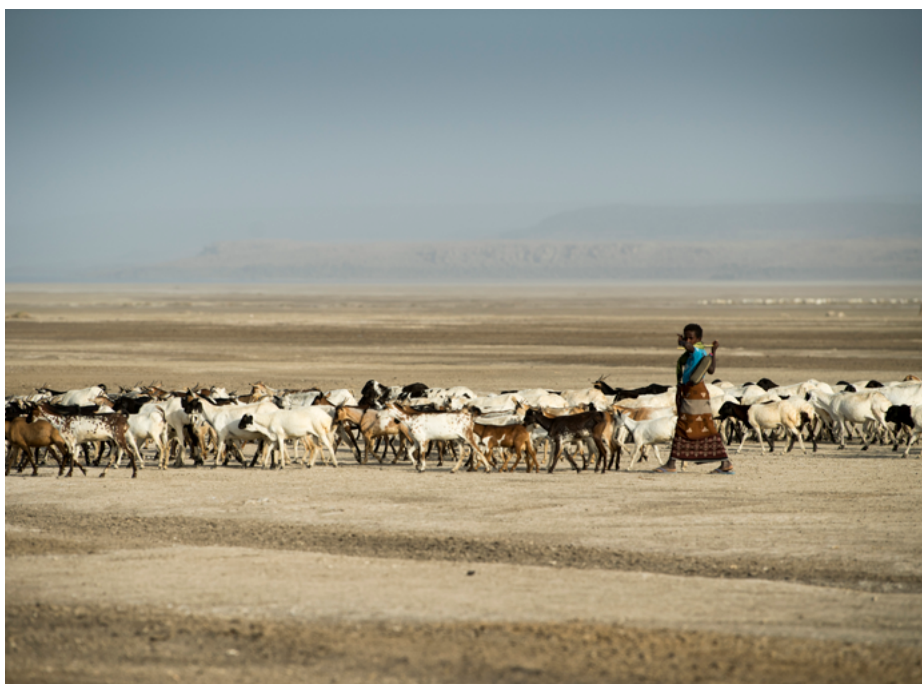
Livestock farming in Ethiopia

Sustainable land management requires the building of relevant capacities and increased funding, especially in developing countries. When delivered as part of responsible development and environmental policies, this capacity building and enhanced funding can help break the 'poverty trap', which otherwise stands in the way of sustainable socio-economic development in environmentally fragile areas (Cao et al., 2021).