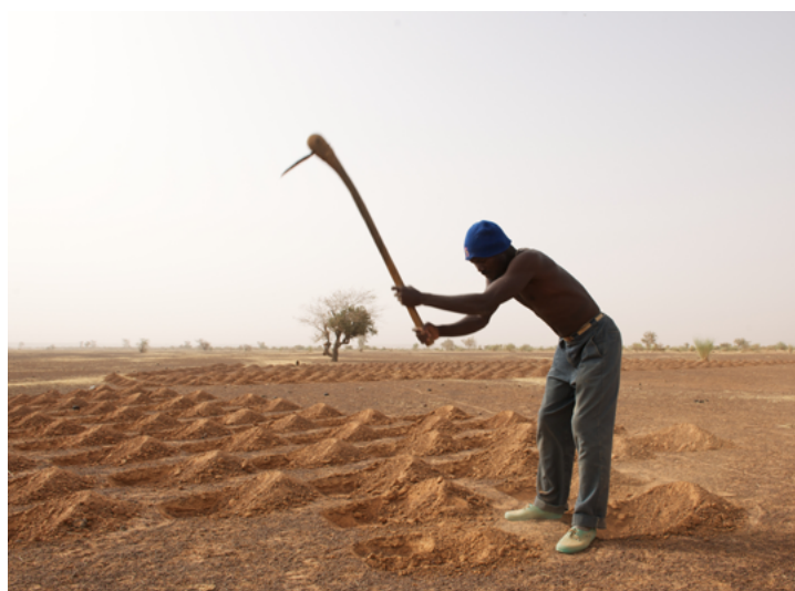
Sustainable land management practice in the drylands of Mali