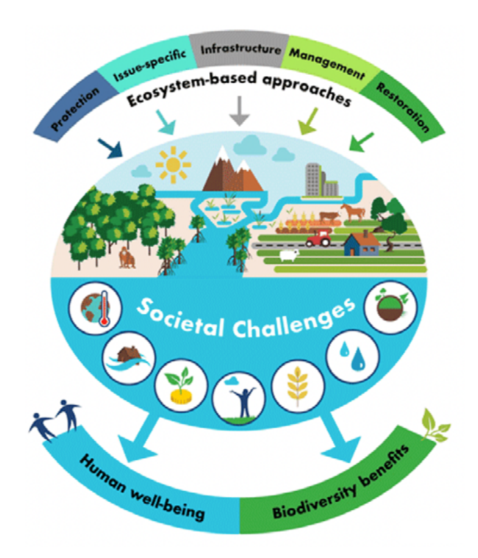
Figure 1 (IUCN, 2020) shows ecosystem restoration as a NbS which addresses societal challenges for the benefit of biodiversity and human wellbeing.